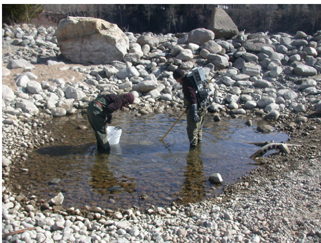
Fig. 5. Image of electrofishing to salvage fish stranded in temporary pools following reduction in river flows associated with planned works at a hydropower facility.

Where fish stranding is caused by hydropeaking (e.g., Bednarek and Hart, 2005; Weber et al., 2007), one strategy that has been evaluated is the control of ramping rates. Generally, more gradual ramping rates have almost universally been identified as having a reducing effect on stranding rates for juvenile salmonids (Bradford, 1997; Halleraker et al., 2003). As such, hydropower ramping rates tend to be prescribed by regulatory agencies, although in some cases there can be unexpected deviations from plans and ramping rates are not always based on empirical data from that system. Indeed, caution should be taken with the application of generic prescribed regulated flow regimes as each system has unique site-specific characteristics (Jones and Stuart, 2008). Arthington et al. (2006) expressed concern that a growing number of dammed facilities are operating under simple, static hydrological “rules of thumb”, i.e., not providing flow variability that simulates natural hydrology. In some cases certain flows or operating conditions may be prescribed in an effort to minimize stranding but there may be other more serious consequences on riverine function and productivity associated with maintaining muted hydrographs in an attempt to save fish from stranding. In efforts to rehabilitate regulated flow regimes,