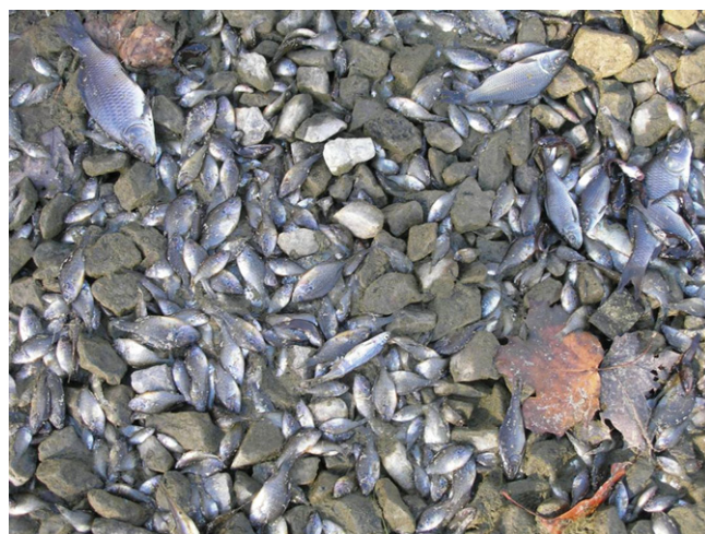
Fig. 4. Image of dead fish found stranded associated with water level drawdown for water management.

Stranding mortality (Fig. 4) occurs for a variety of reasons, with the most obvious being complete dewatering such that the fish is unable to respire and becomes desiccated (Evans, 2007). Death can also occur as a result of lack of dissolved oxygen (i.e., hypoxia or anoxia) or rapid fluctuations in water temperature (e.g., cold shock; Donaldson et al., 2008) that can occur in small temporary pools. In the winter, fish can become trapped in ice leading to mortality (Brown et al., 2001). Predation is presumably quite common and is a source of mortality for fish in temporary pools (Quinn and Buck, 2001). Moreover, when fish are stranded, they may be subject to easy capture and harvest by humans which in many cases is illegal,