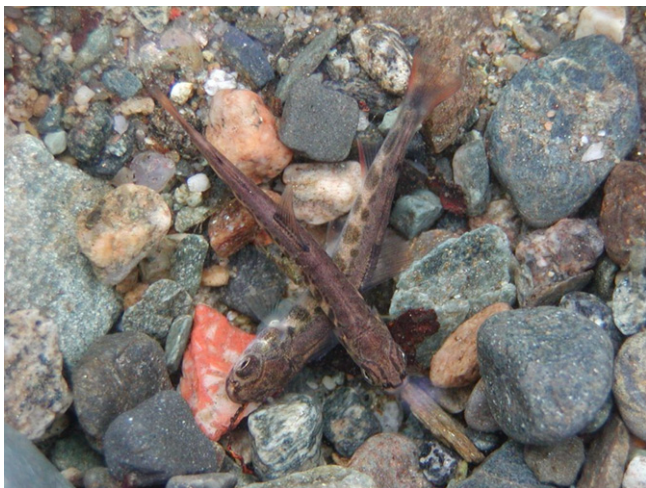
Fig. 1. Image of juvenile salmonids stranded downstream of a hydropeaking generating station.