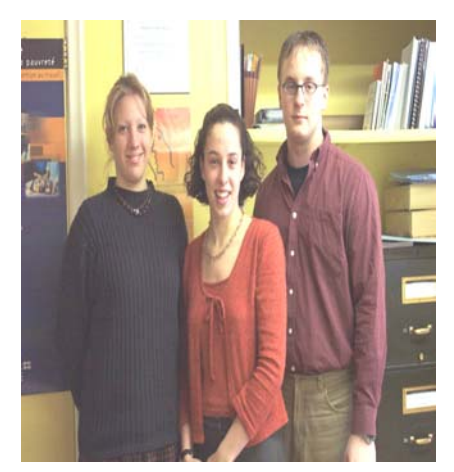
Staff of the Montmagny-L'Islet Commmunity Development Corporation

To meet this need, CEDTAP provided funds for an elaborated business plan, one that explored alternative financing possibilities and set out the financing arrangement.