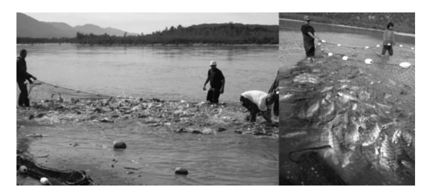
Fig. 2. The aboriginal beach seine being pulled into shore to crowd fish for sorting.